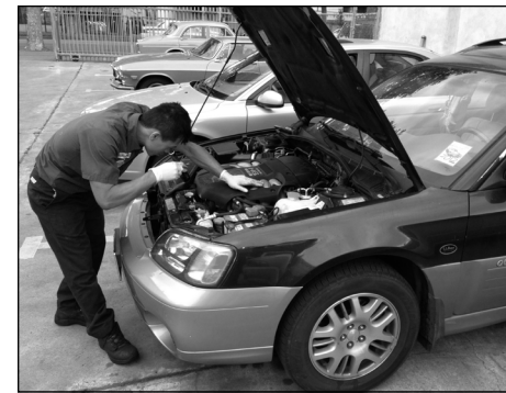
Trisno in diagnostic mode, under the hood of a 2001 Subaru Outback 3.0

The popularity of Subarus can not be denied, and Ackerman's is getting on board! These cars is getting on board! These cars provide the safety of all wheel drive, reliability and lower maintenance